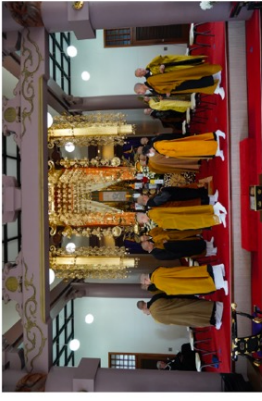
Ministers chant and walk in circumambulation