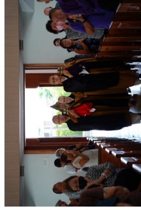
Priests entering the temple hall