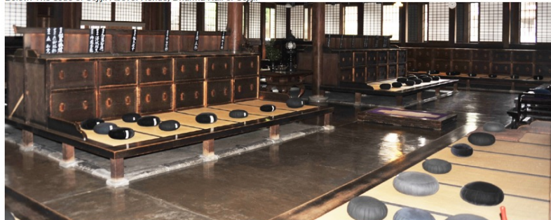
Below: The sodo of Sojiji. Above: Hondo, Dharma Hall of Sojiji.

We look forward to seeing you on the journey.