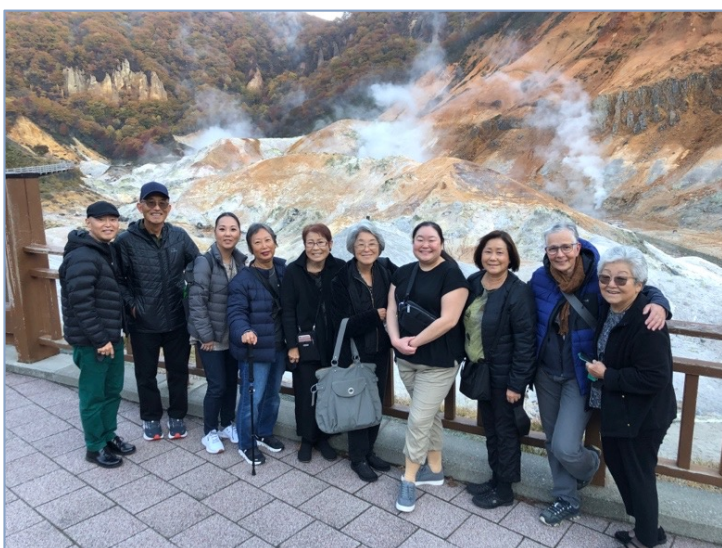
(Below) Mantokuji members in Hokkaido (left: Noboribetsu Onsen; right: Uzusan)