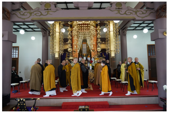
Ministers chant and walk in circumambulation